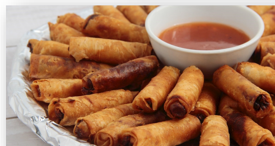
Filipino Style Lumpia

a fun team building activity and great support for HIKE