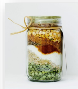
Mason Jar Soups