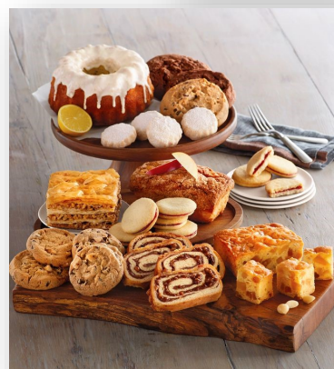
Breads, Cookies, Cakes