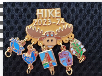
2023-2024 HIKE PIN & CHARMS

THEHIKEFUND1985@GMAIL.COM 530 ELLIOTT ST. COUNCIL BLUFFS, IA 51503