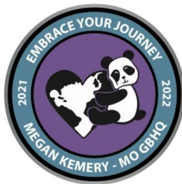
Pins - $6