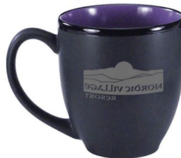
Bistro Mug will include the Jobie Love logo $8