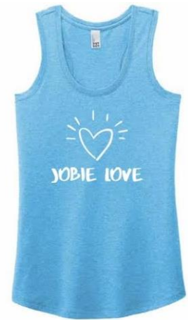
Tanks - $12