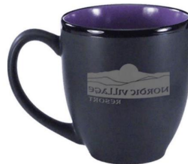
Bistro Mug will include the Jobie Love logo $8