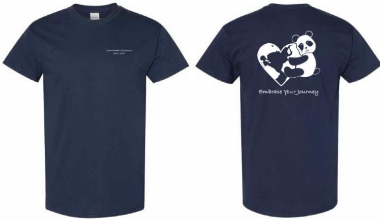
T-shirts - starting at $15